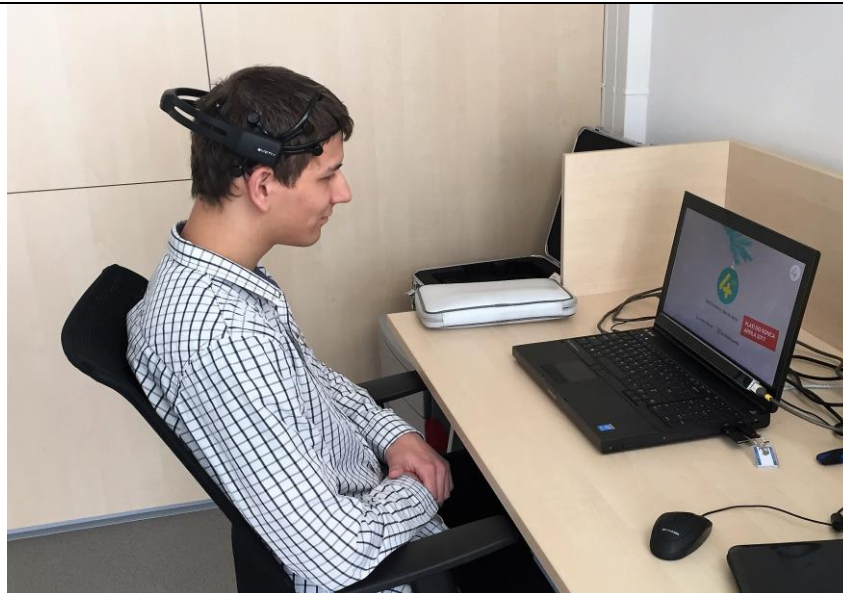
Figure 1: EEG and eye tracking testing

The goal of this article is to identify, measure, and compare the impact of visual advertising on potential customers. The research object was the advertisement of mobile network operators active in Slovakia. Currently, there are four mobile network operators in the Slovak market offering various service packages. These operators have their own frequencies assigned, and they are building their own networks. In addition to providing services under their own name, the operators are offering mobile services, which give the impression that there are other operators. These services, so called “children” of big operators, are Funfón of the Orange Corporation and Juro of the Telekom Corporation. In addition to these, there is also Tesco mobile – a virtual operator, who does not own a mobile network, but it has signed an agreement with a registered provider of services. Tesco mobile has a signed agreement with O2 – it uses its network, but offers services under its own name.