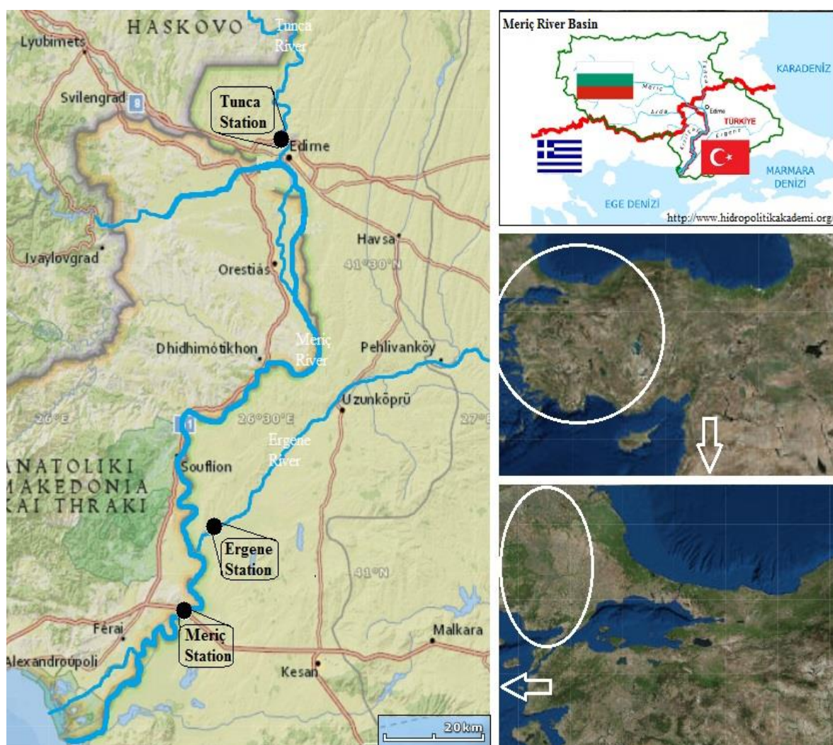
Figure 1: Map of study area