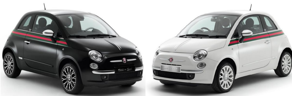
Figure 1: Fiat 500 Gucci Black and Fiat 500 Gucci White

In 2011, with dual celebrations of the 150th anniversary of Italian unification and the 90th anniversary of the brand Gucci, Gucci and FIAT presented a joint edition, the Fiat 500 Gucci. This car was available in two versions: black and white. The black version had a shiny chrome interior, which sharply contrasted with white trimmings. The white version was finished in satin chrome in an ivory color, with black detailing that was a gentle contrast, compared with the black version ("Fiat 500 Cabrio by Gucci garners recognition as the 'best small convertible of the year' at SAMA convertible driver", 2012). The car had colossal popularity and a crowd of supporters. The cooperation of two brands enabled the undoubted success of both (Successful Fiat 500 by Gucci edition makes an encore in the US, 2013).