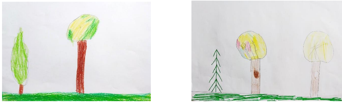
Figure 3: Children's drawings from the first stage

mixed painting techniques, combining pictorial and non-pictorial materials, children work creatively with fantasy and imagination.