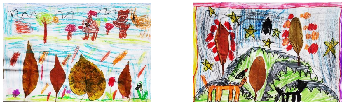
Figure 4: Children's drawings from the second stage